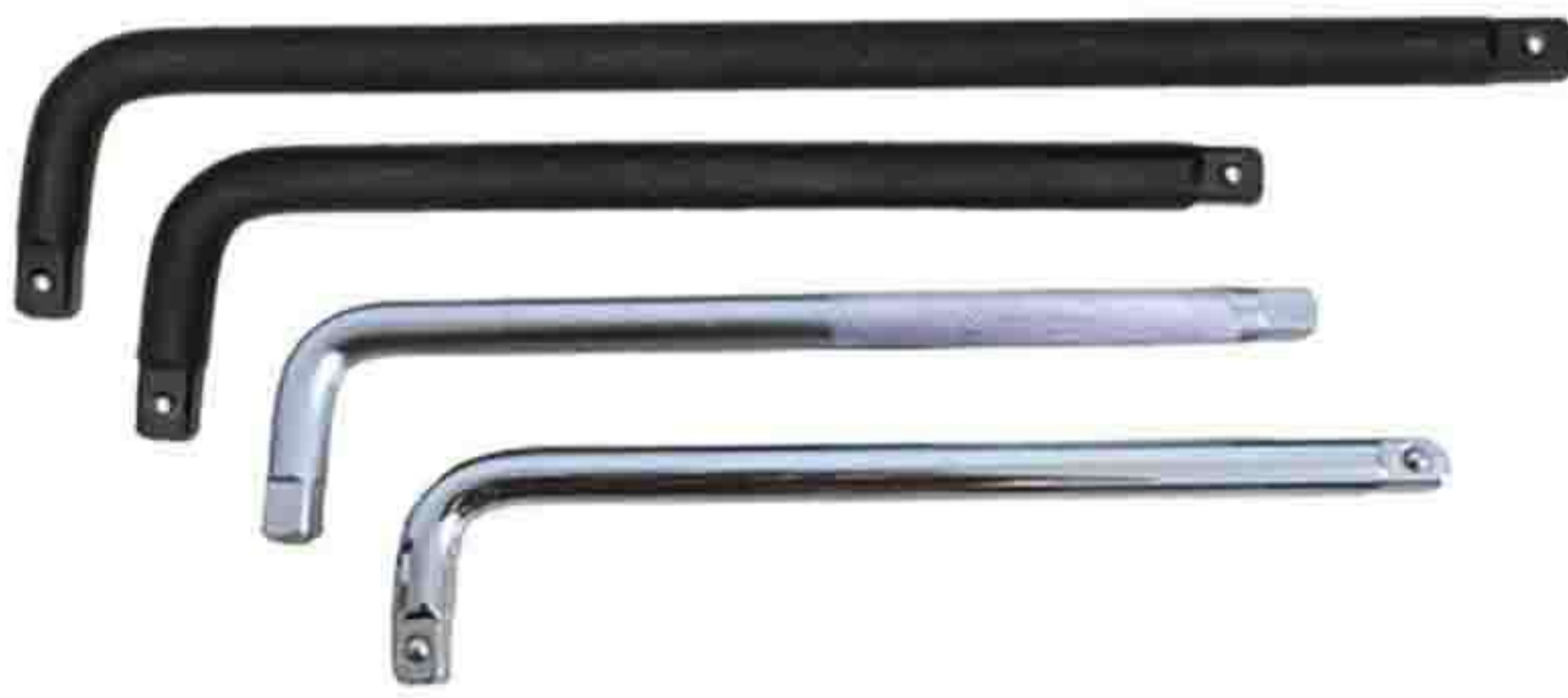
3/4(19mm)系列铬钒钢L型重型弯杆 3/4" Dr. L-shape handle series(Cr-v)