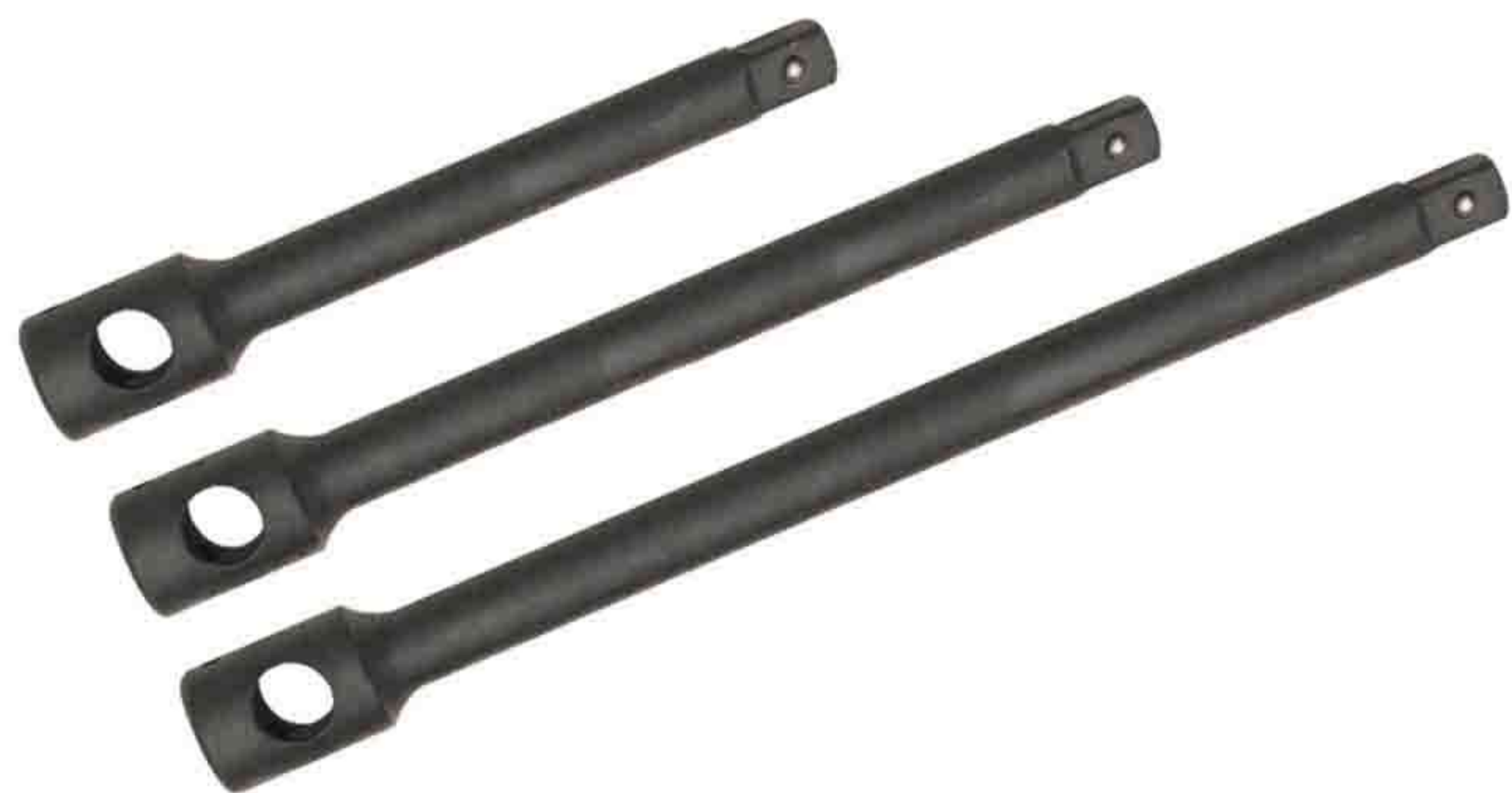
3/4(19mm)系列铬钒钢重型接杆 3/4" Dr. impact extension bar series(Cr-v)