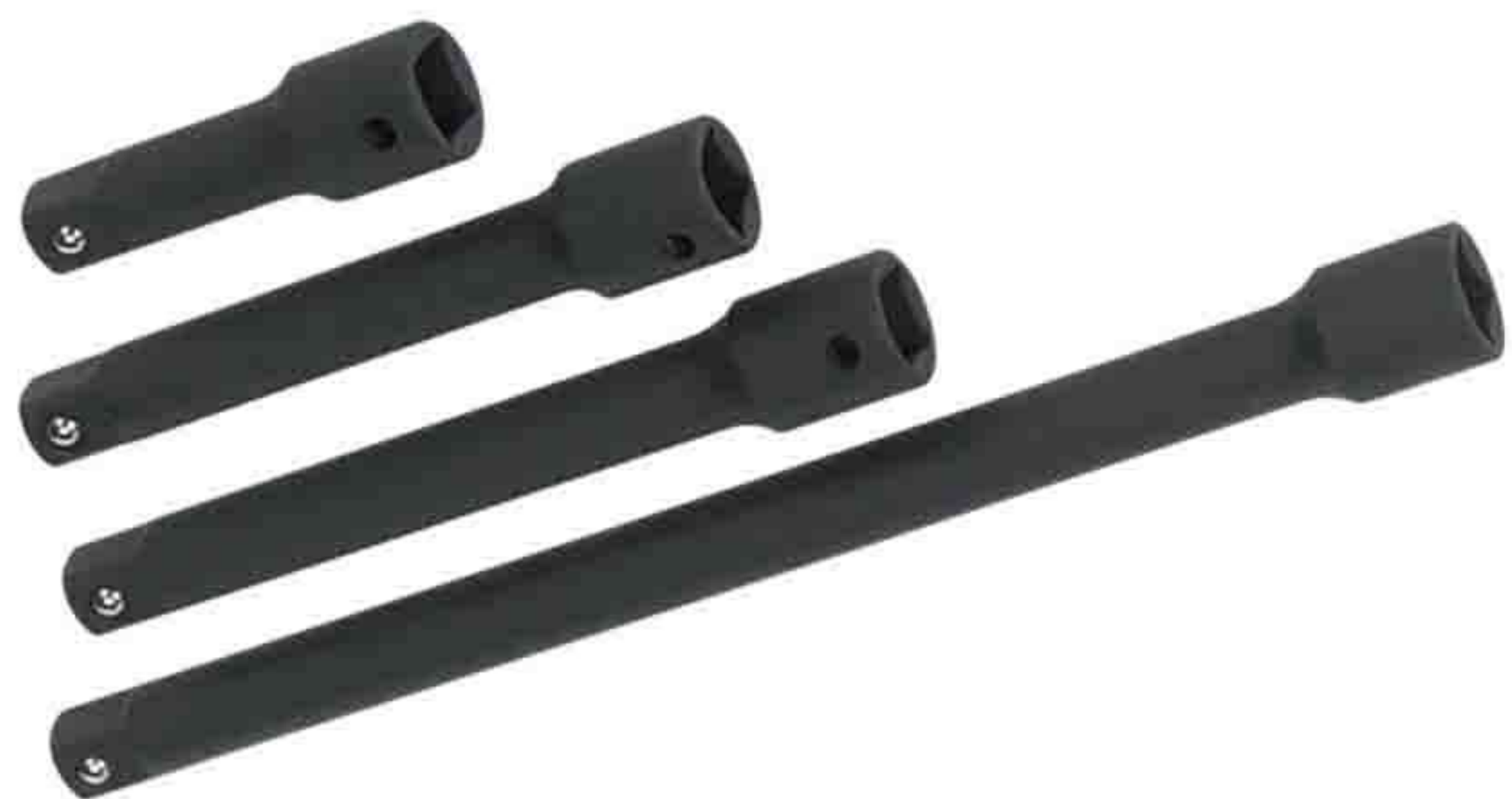
1/2(12.7mm)系列铬钒钢接杆 1/2" Dr. impact extension bar series(Cr-v)