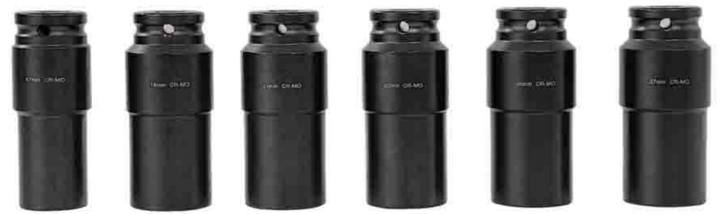
1/2" 系列铬钼钢重型气动加长套筒 1/2" Dr. Harmonic Balancer Socket Series (CR-MO)