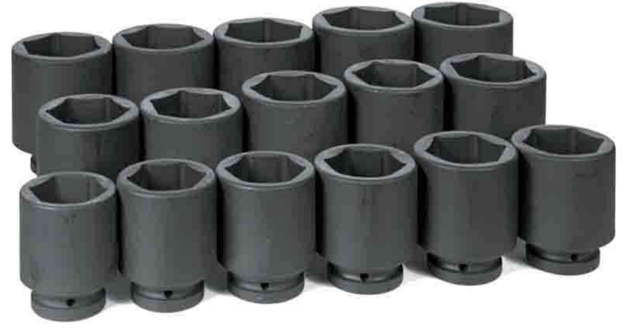
1" 系列铬钼钢欧式气动加长套筒 1" Dr. Deep Impact Socket Series(CR-MO)