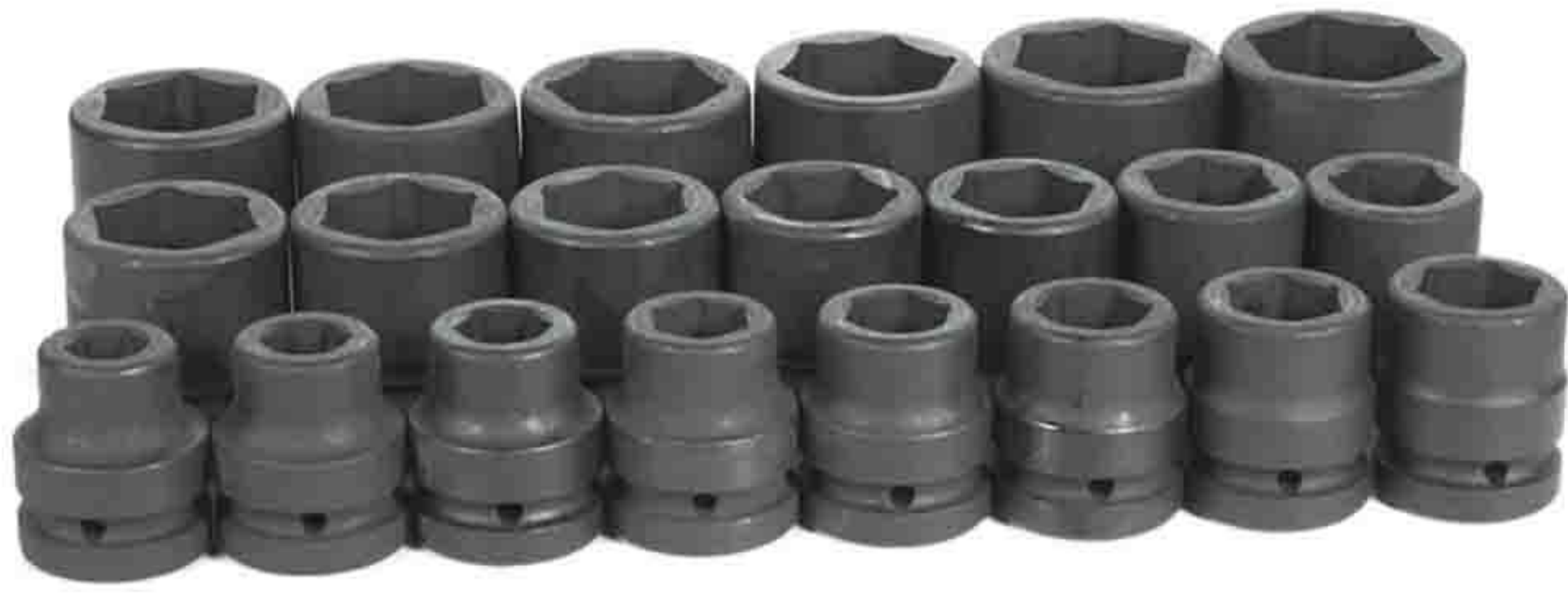
1" 系列铬钼钢工业级欧式气动短套筒 1" Dr. Industrial Impact Socket Series(CR-MO)