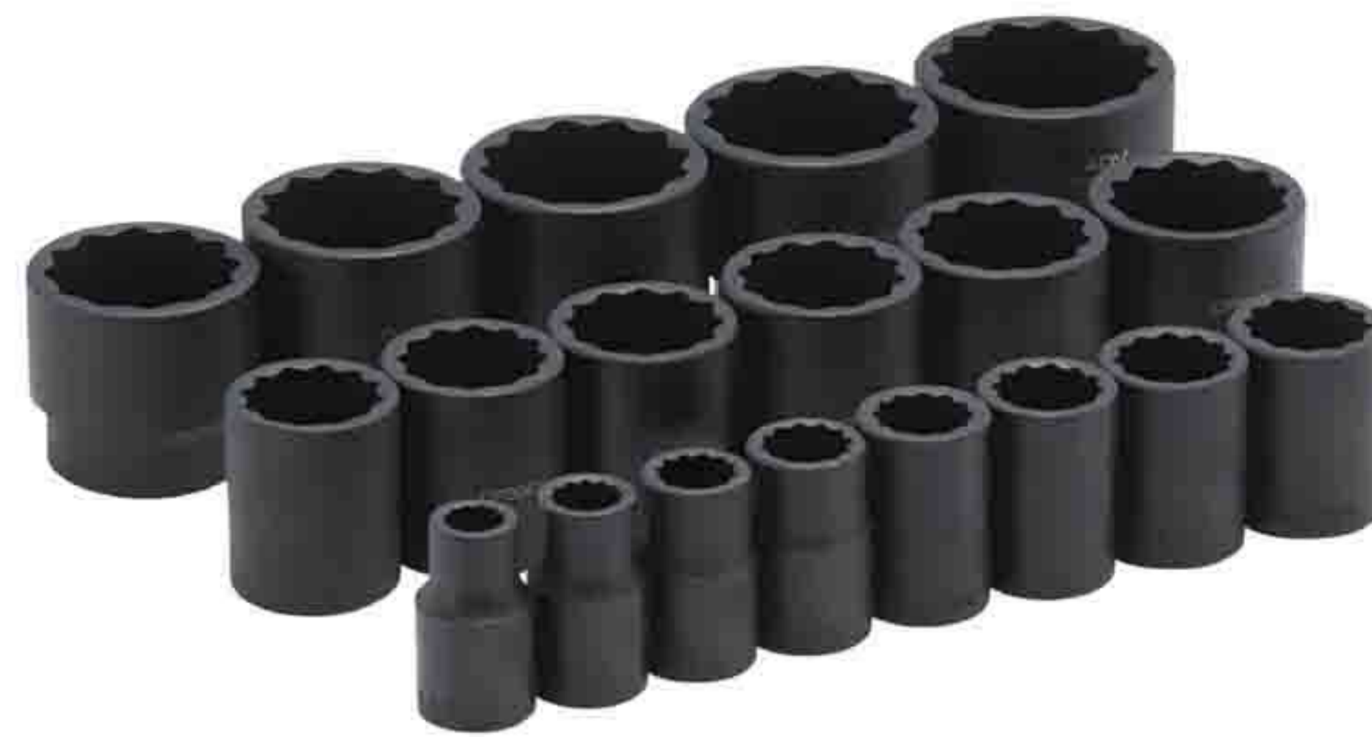
3/4" 系列铬钒钢美式梅花短套筒 3/4" Dr. Socket Series 12PT (CR-V)