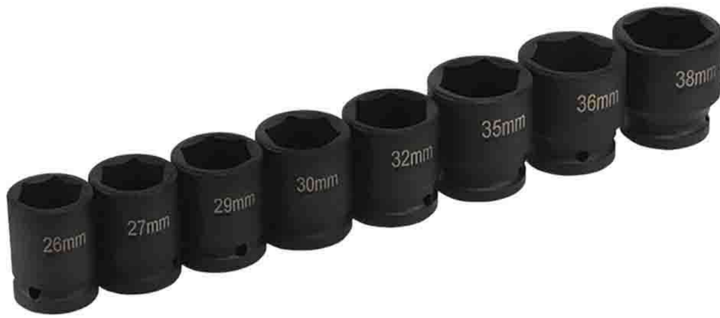
3/4(19mm)系列铬钒钢欧式气动短套筒 3/4" Dr. impact socket series(Cr-v)