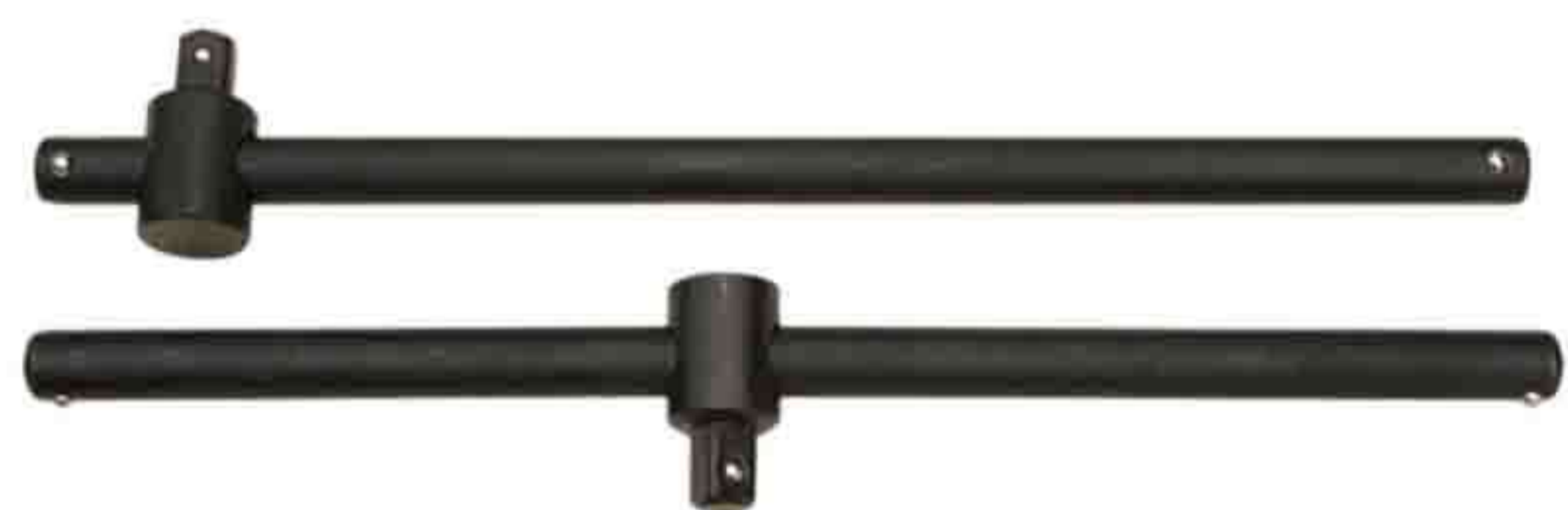
1(25mm)系列铬钒钢T型重型滑杆 1" Dr. Sliding T-bar series(Cr-v)