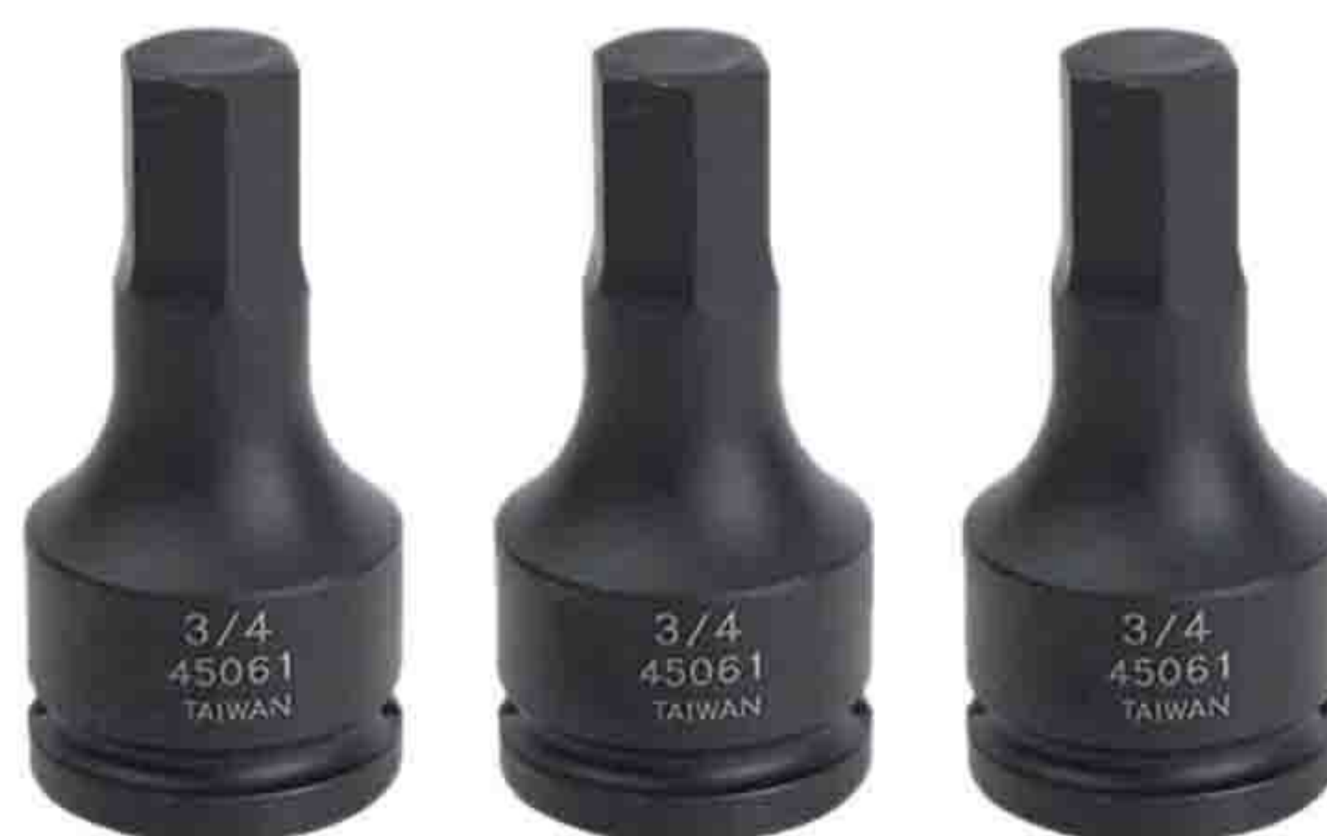
3/4" 系列铬钼钢一体外六方旋具套筒 3/4" Dr. impact hex socket series (CR-MO)