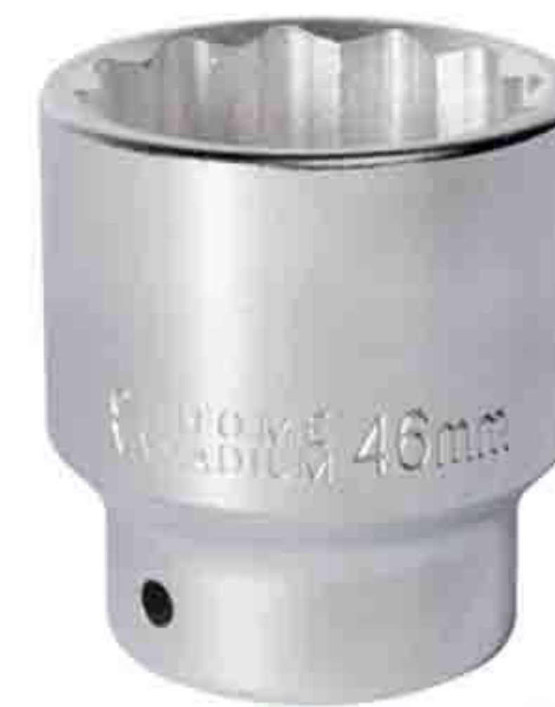
1" 系列铬钒钢美式梅花短套筒 1" Dr. Socket Series 12PT (CR-V)