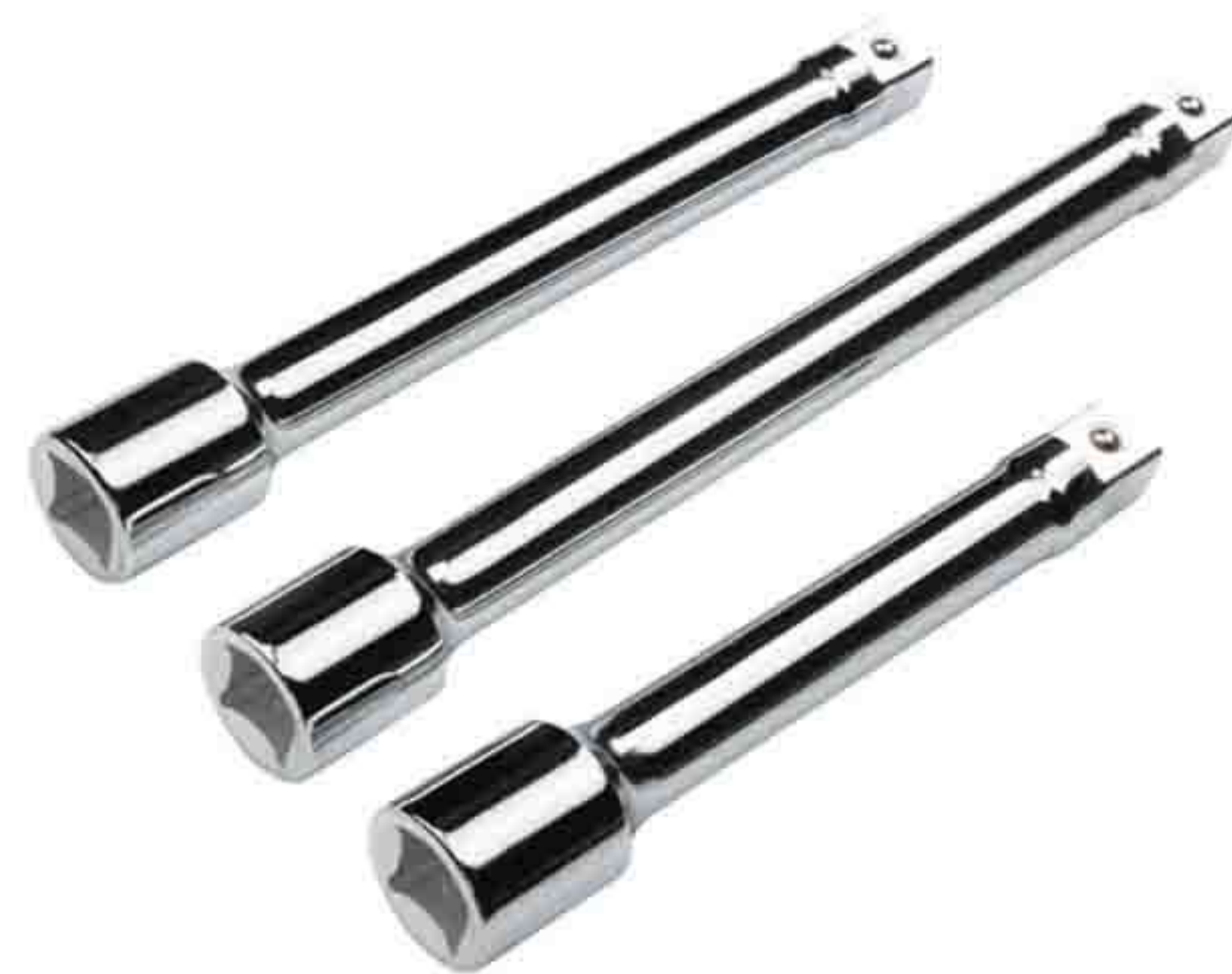
3/4(19mm)系列铬钒钢重型接杆 3/4" Dr. impact extension bar series(Cr-v)