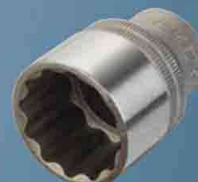
Outside surface partially ground