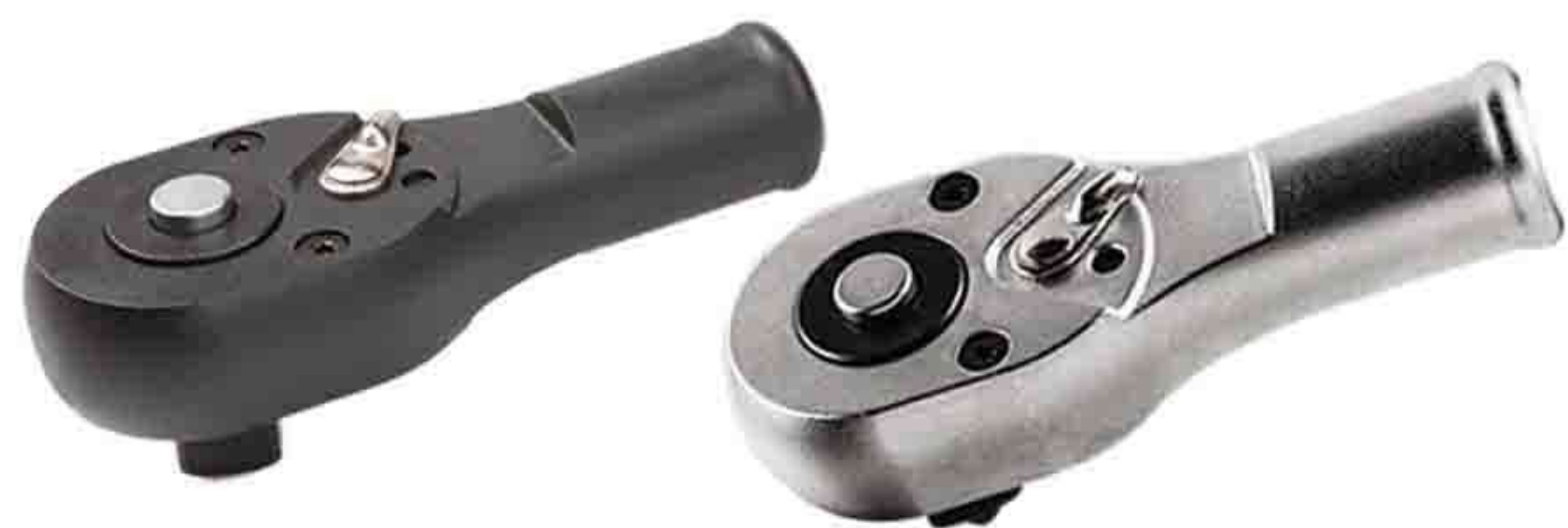
24齿快脱棘轮扳手 24 Teeth Quick Release Ratchet Wrench Series