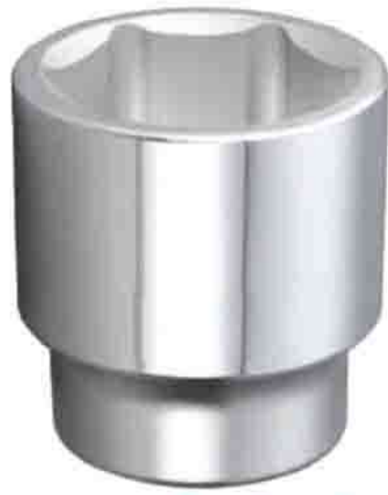
1" 系列铬钒钢美式六角短套筒 1" Dr. Socket Series 6PT (CR-V)