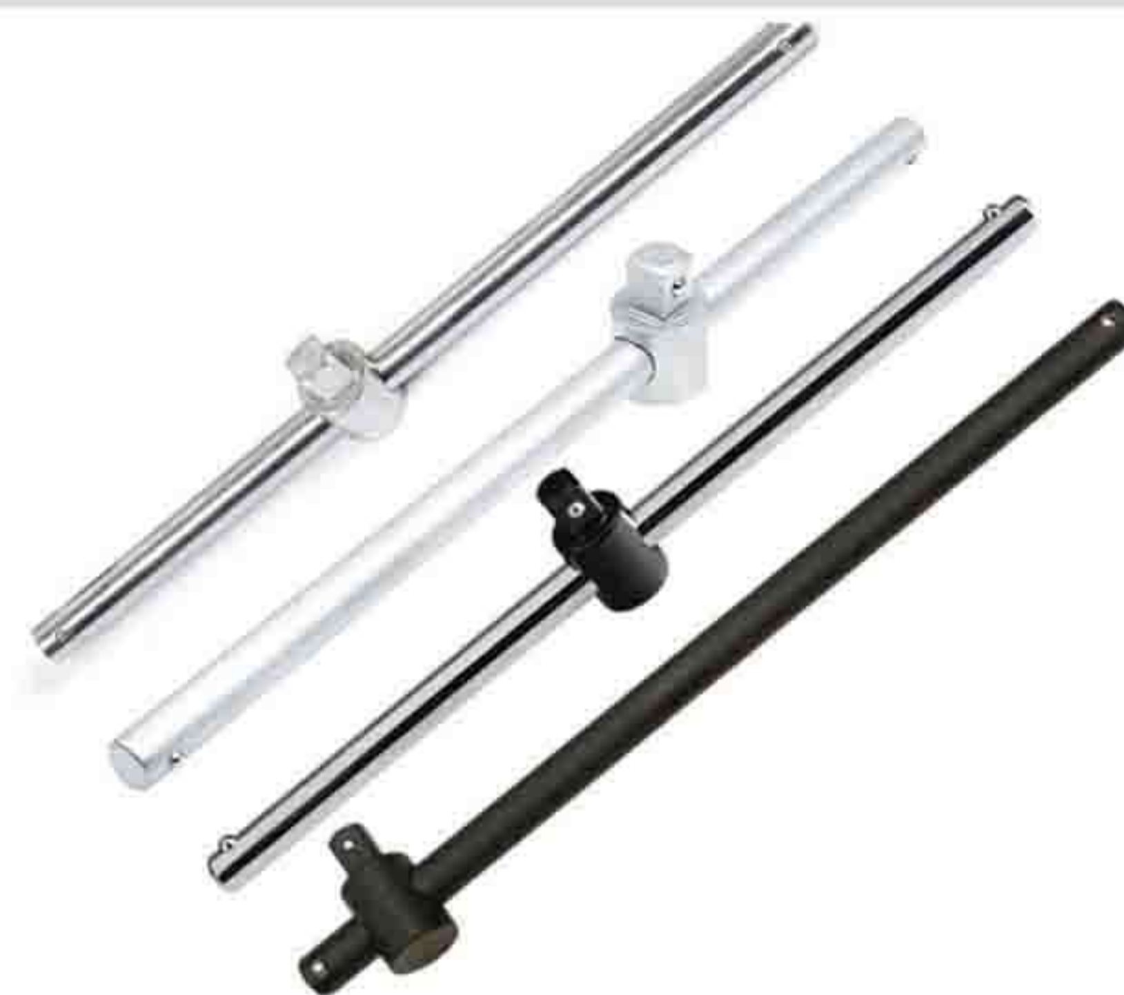
3/4(19mm)系列铬钒钢T型滑杆 3/4" Dr. Sliding T-bar series(Cr-v)