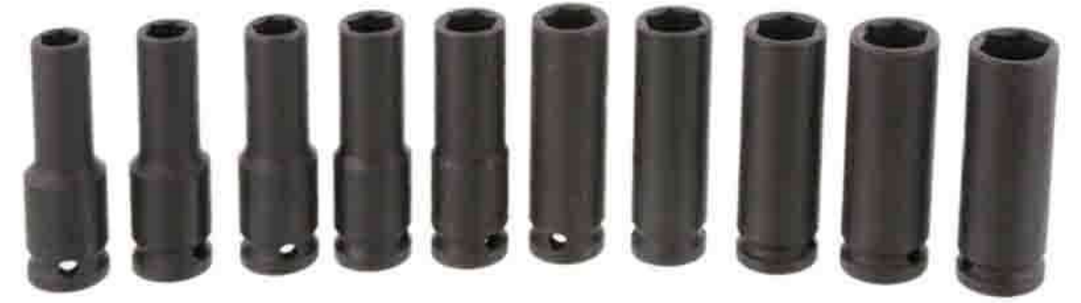
1/2(12.7mm)系列铬钼钢欧式气动长套筒 1/2" Dr. impact socket series(Cr-Mo)