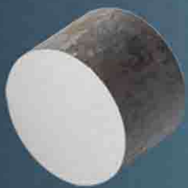
Material section sawn from round bar steel