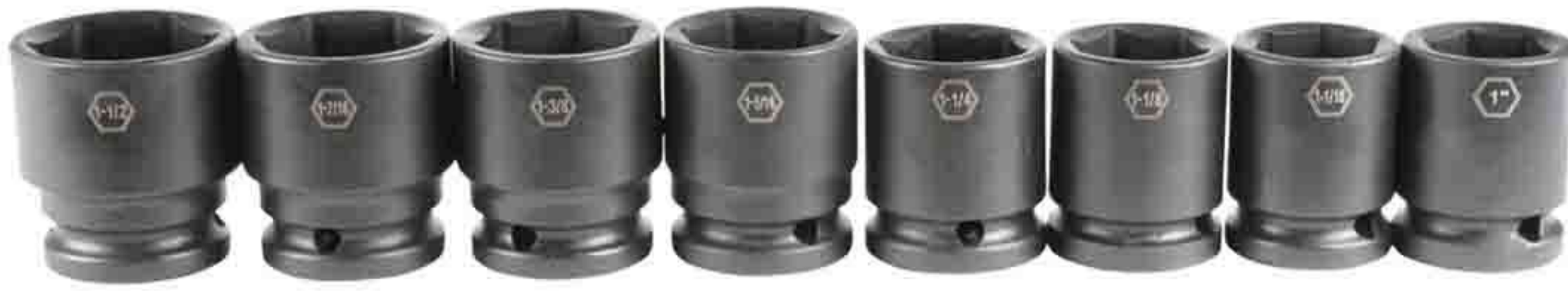
3/4" 系列铬钼钢工业级欧式气动短套筒 3/4" Dr. Industrial Impact Socket Series(CR-MO)