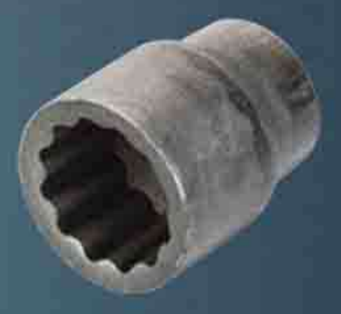
Cold extrusion, inside profile produced ready, outside profile adjusted