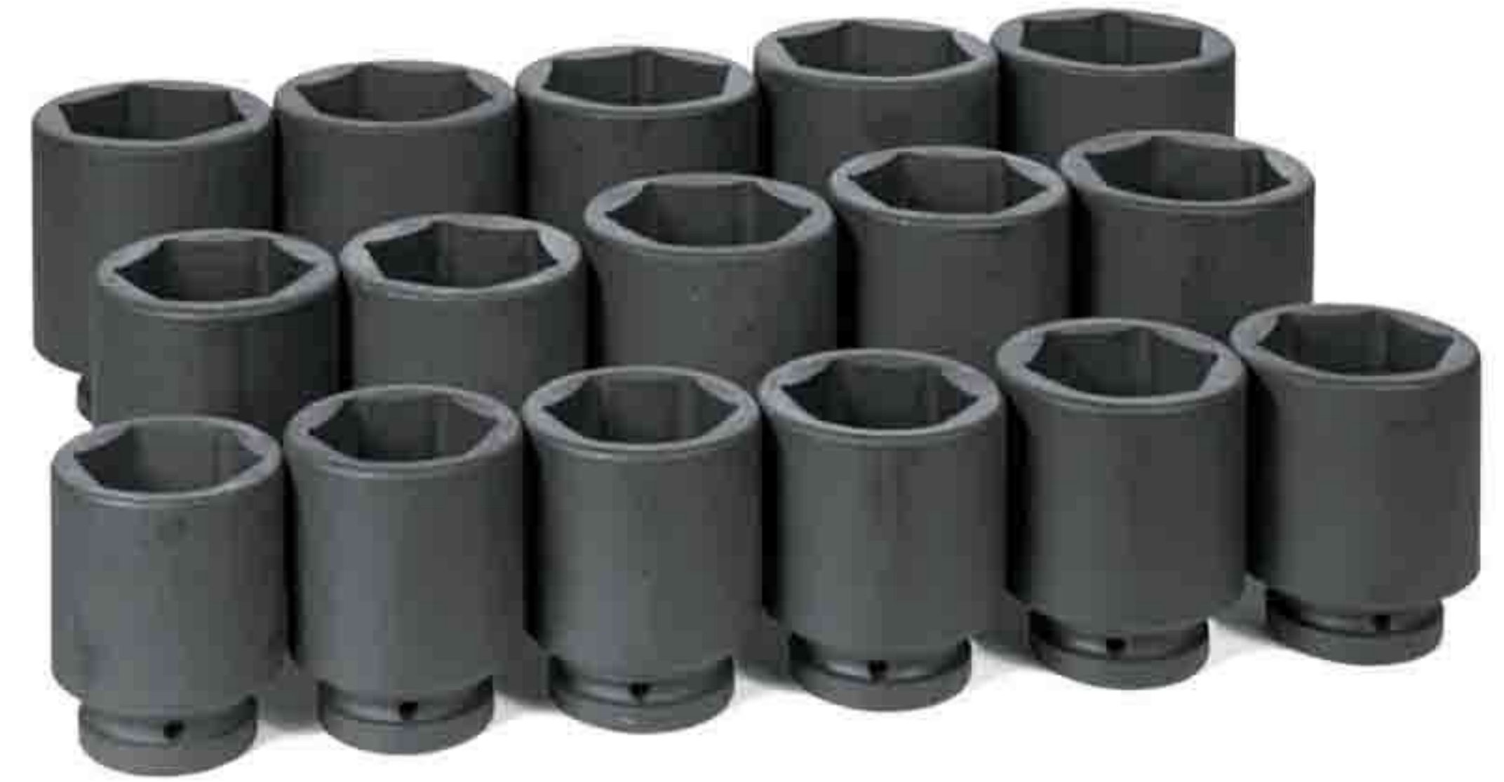
1-1/2" 系列铬钼钢工业级欧式气动短套筒 1-1/2" Dr. Industrial Impact Socket Series(CR-MO)