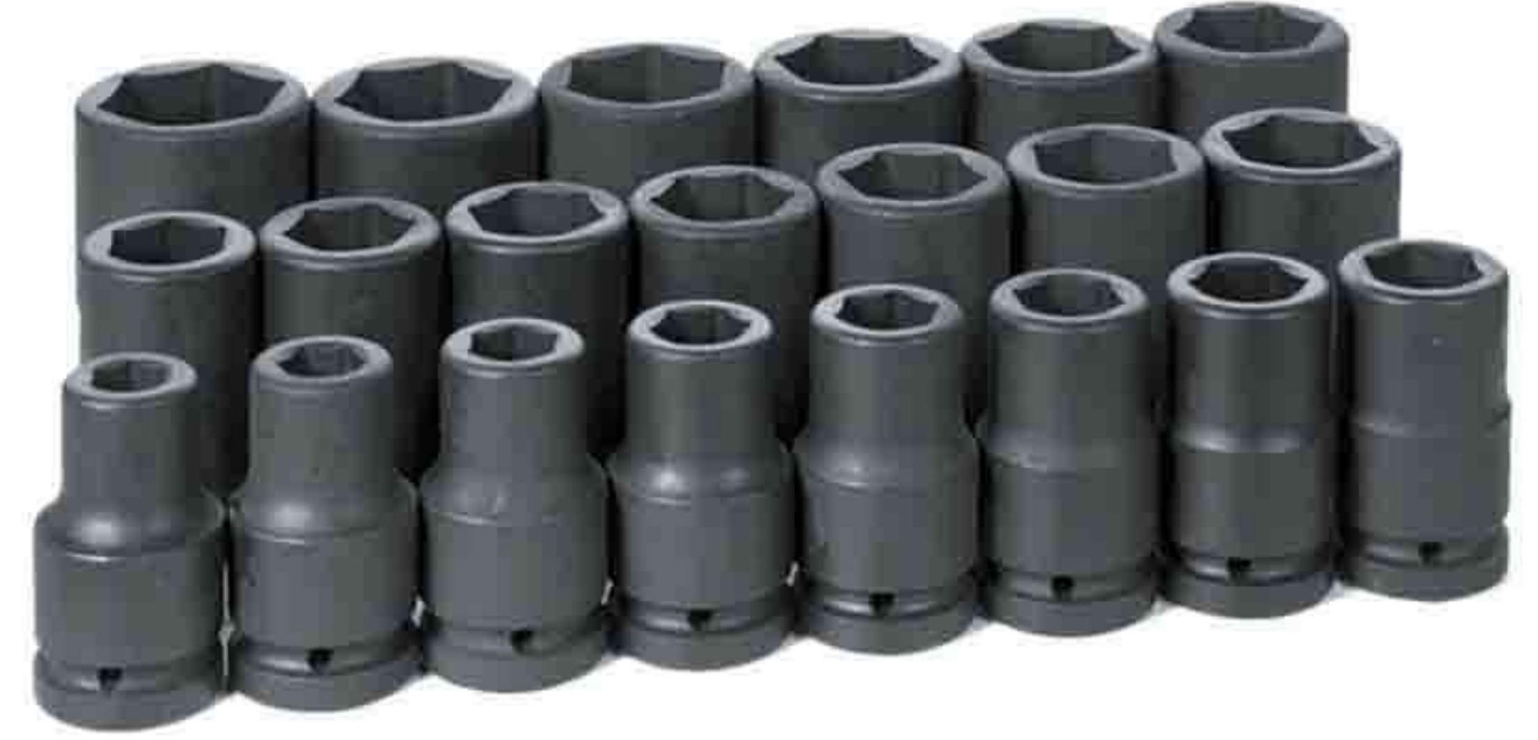
1" 系列铬钼钢工业级欧式气动长套筒 1" Dr. Industrial Deep Impact Socket Series(CR-MO)