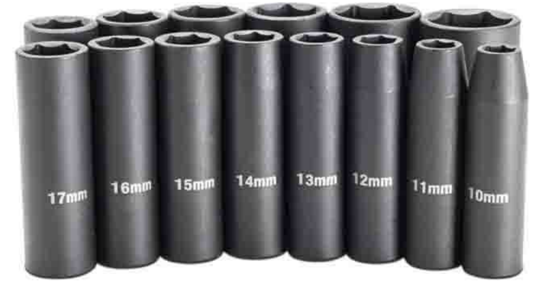
1/2(12.7mm)系列铬钼钢欧式气动长套筒 1/2" Dr. impact socket series(Cr-Mo)