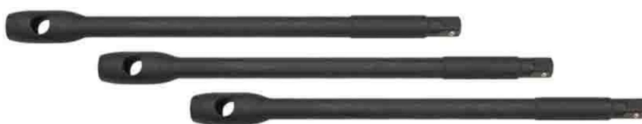
3/4(19mm)系列铬钒钢重型加力杆 3/4" Dr. impact extension bar series(Cr-v)