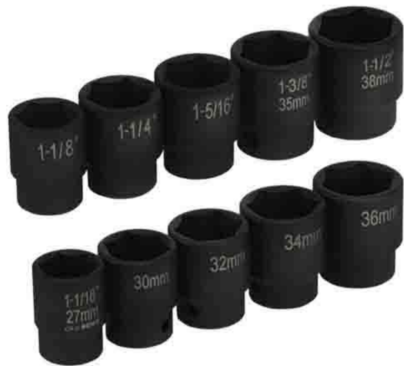
3/4" 系列铬钒钢美式六角短套筒 3/4" Dr. Socket Series 6PT (CR-V)