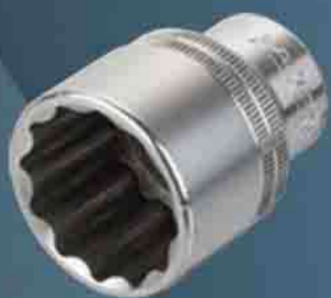
Mechanically worked, turned, drilled, inner groove milled, knurled and inscribed