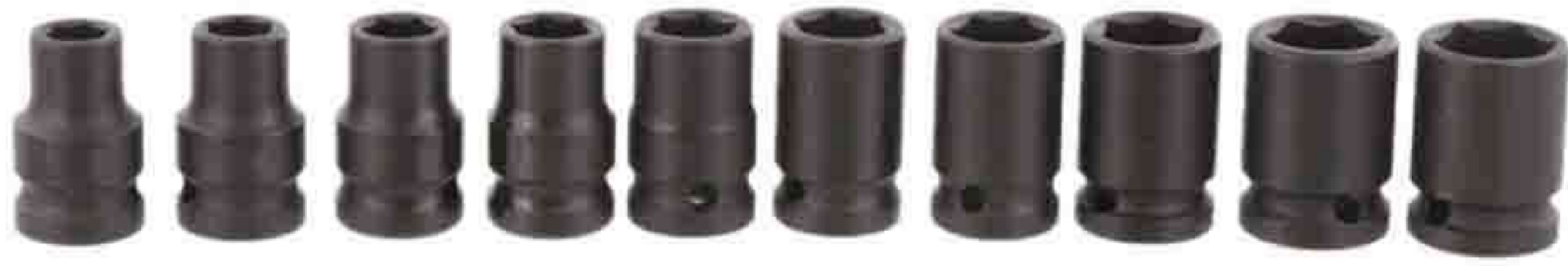
1/2(12.7mm)系列铬钼钢欧式气动短套筒 1/2" Dr. impact socket series(Cr-Mo)