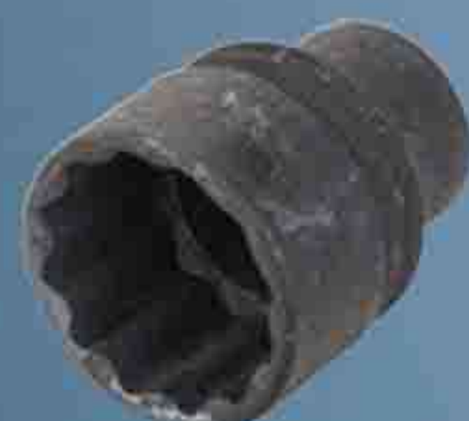
Coated = hardened and tempered