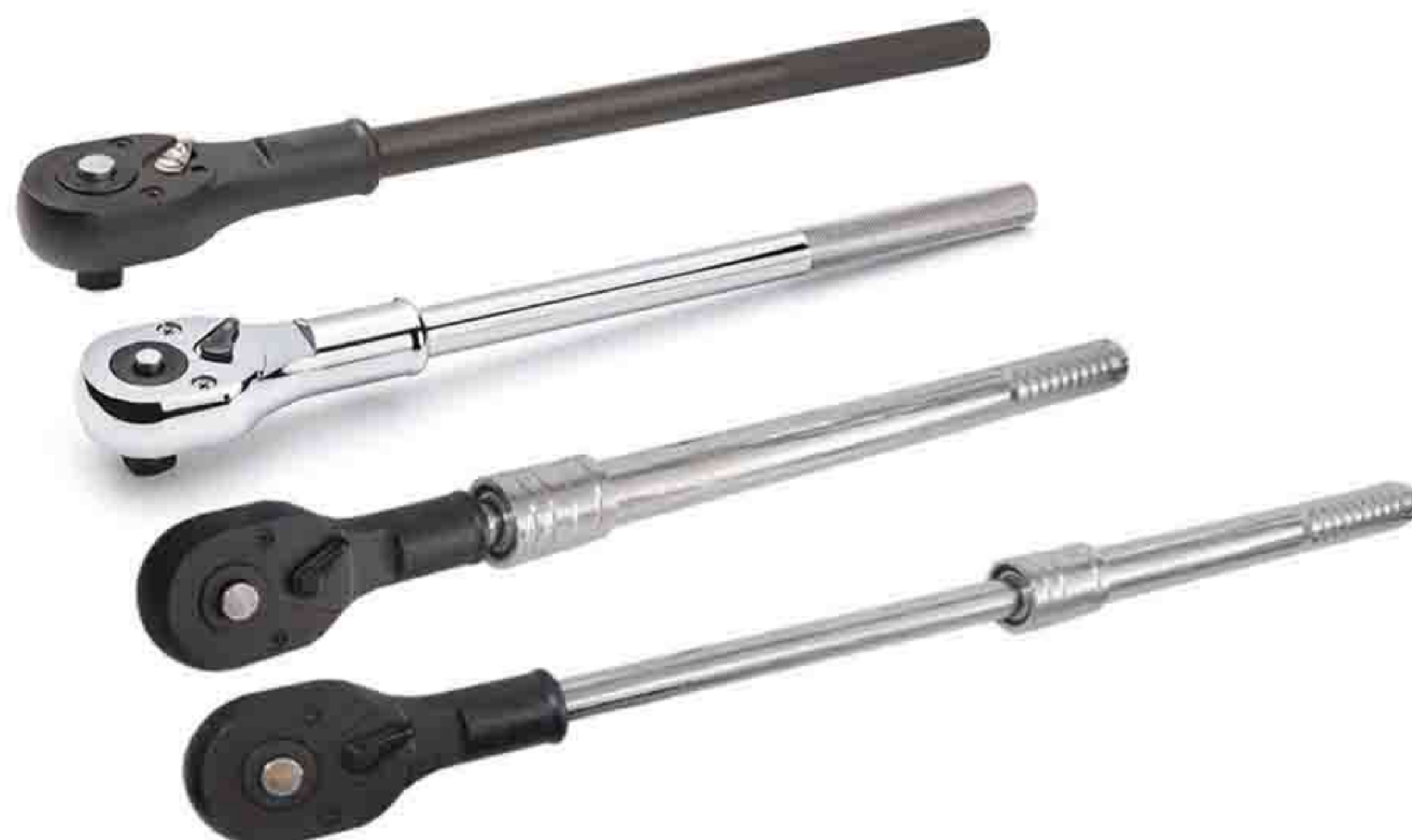
24齿快脱棘轮扳手 24 Teeth Quick Release Ratchet Wrench Series