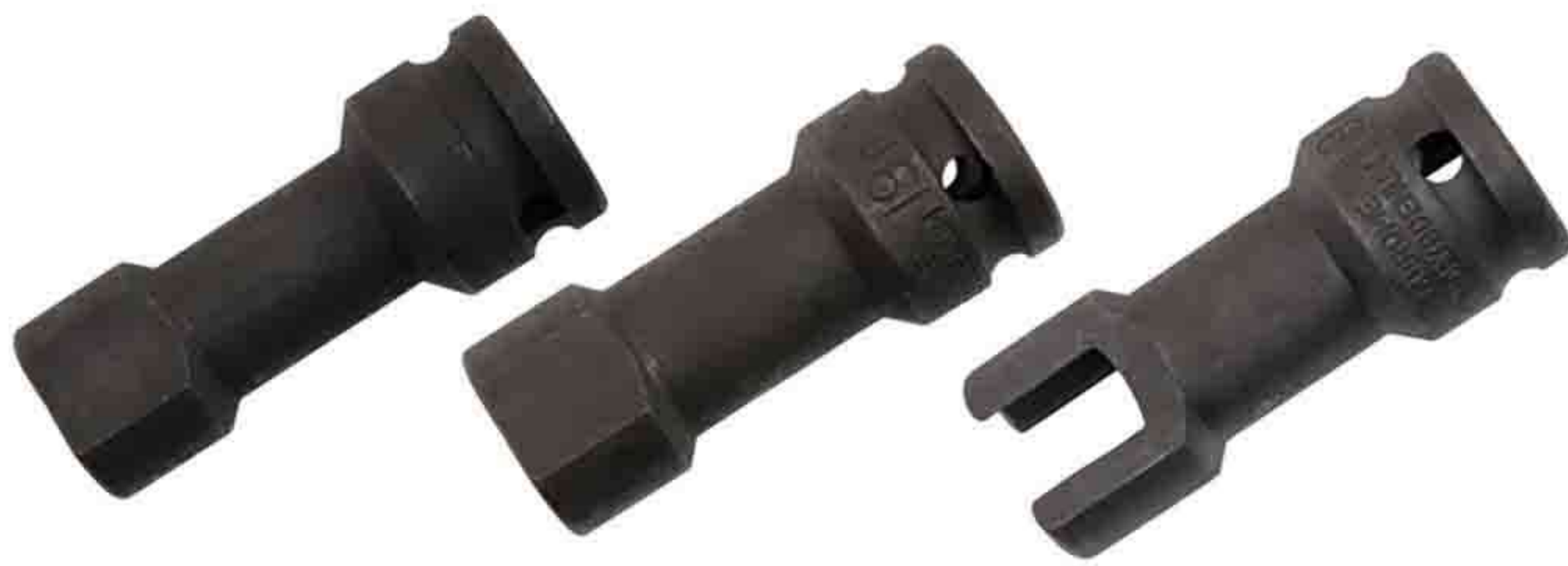
1/2" 铬钼钢气动卡槽通道套筒 1/2" Dr. Impact Strut Channel Socket (CR-MO)