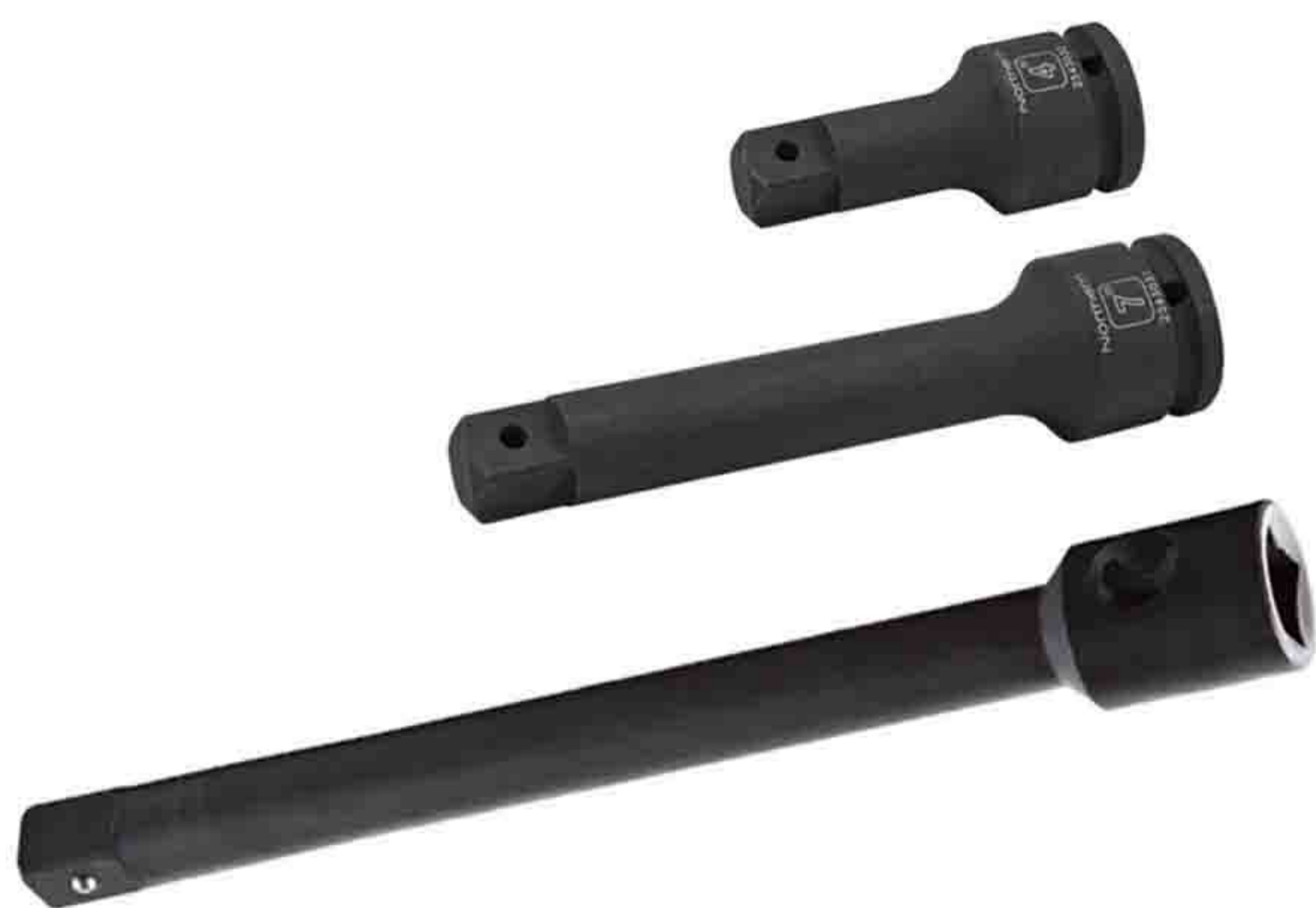
1(25mm)系列铬钒钢接杆 1" Dr. impact extension bar series(Cr-v)