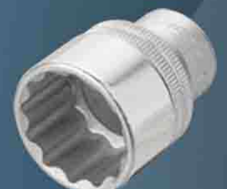
Nickel-plated and chrome-plated