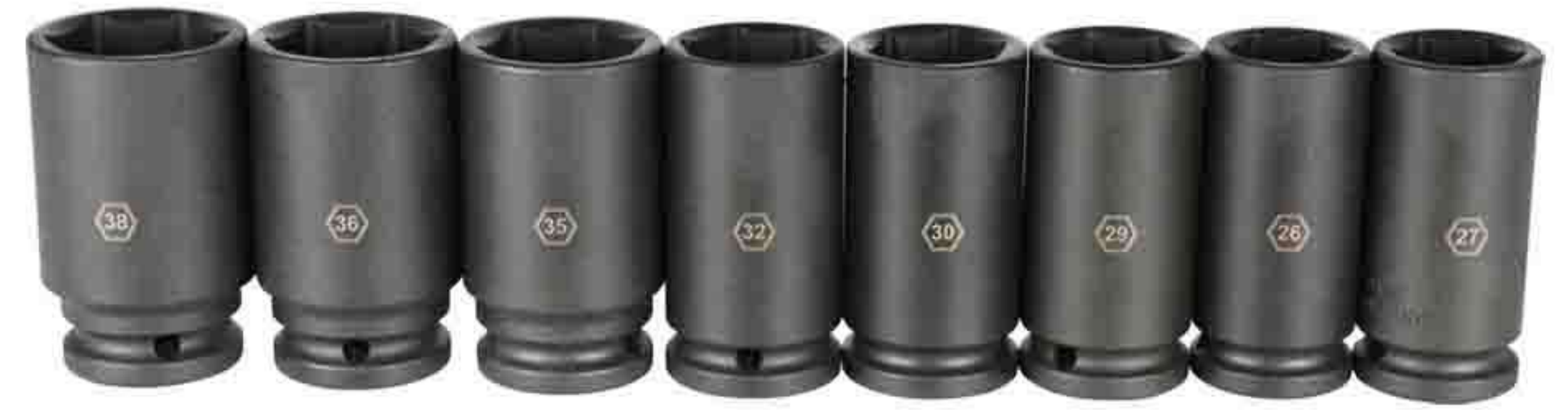
3/4" 系列铬钼钢工业级欧式气动长套筒 3/4" Dr. Industrial Deep Impact Socket Series(CR-MO)