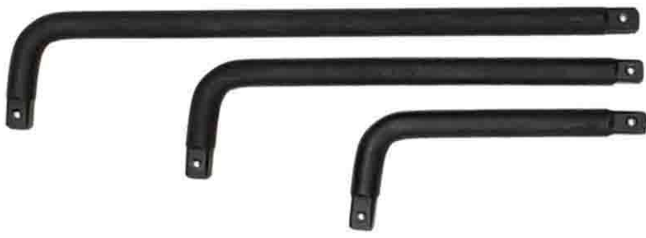
1/2(12.7mm)系列铬钒钢L型弯杆 1/2" Dr. L-shape handle series(Cr-v)