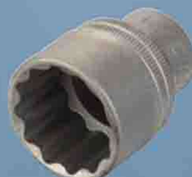
Surface worked, sand-blasted