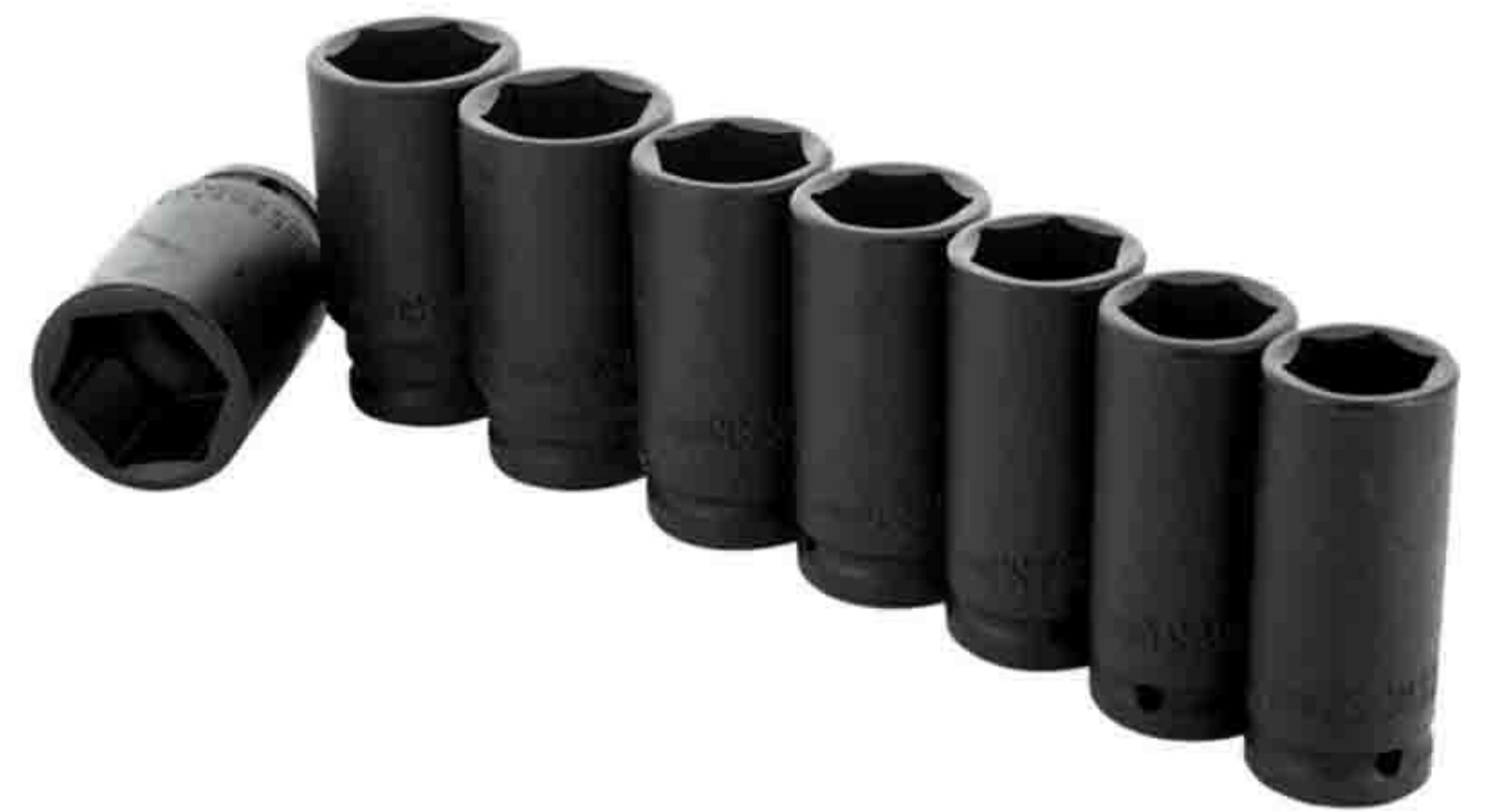
3/4(19mm)系列铬钒钢欧式气动长套筒 3/4" Dr. impact socket series(Cr-v)