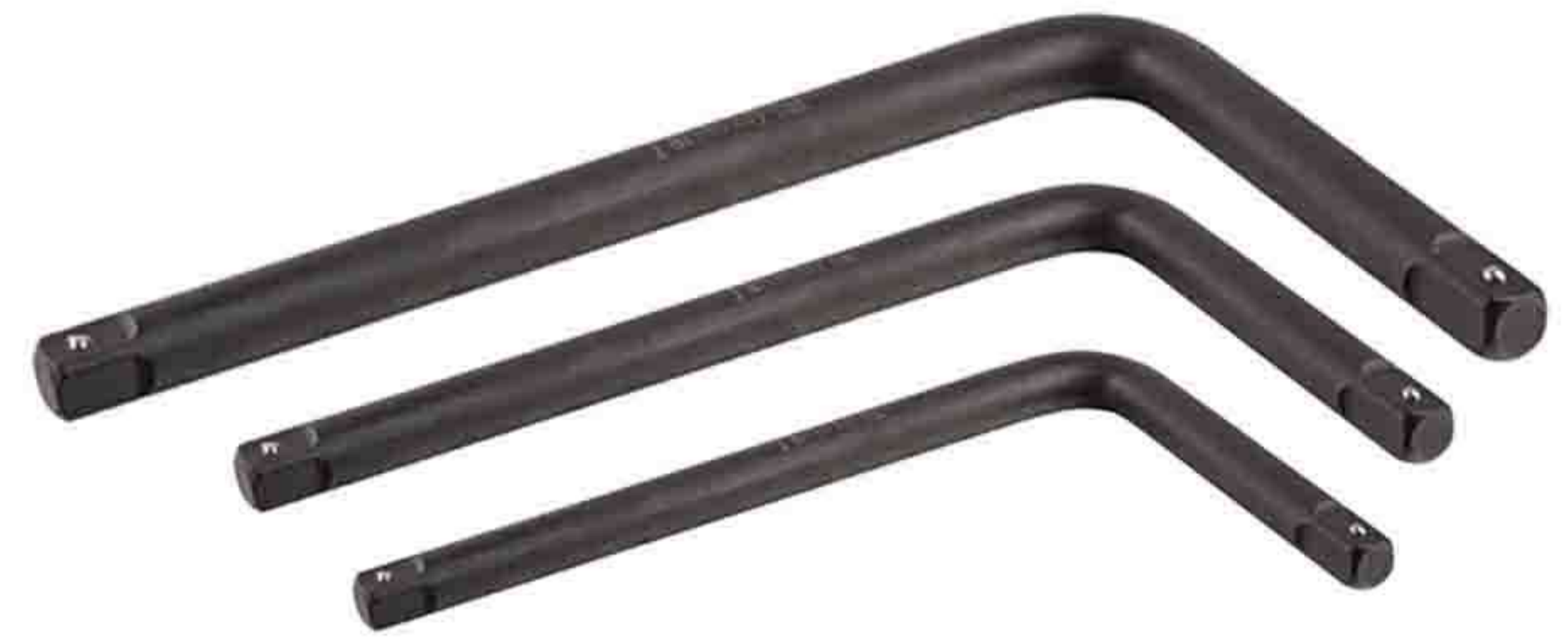
1(25mm)系列铬钒钢L型弯杆 1" Dr. L-shape handle series(Cr-v)