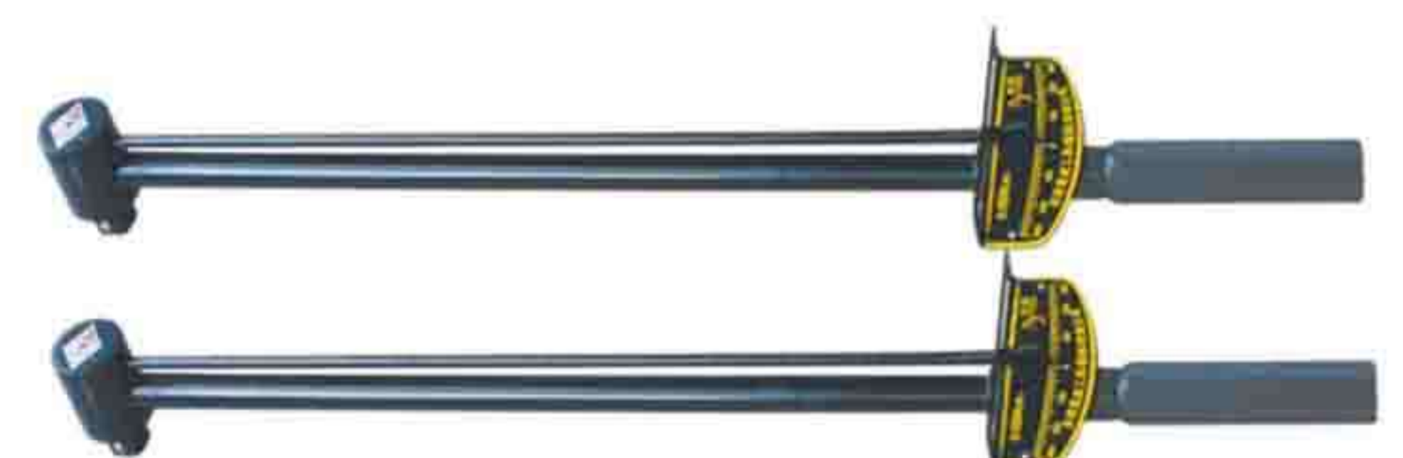
3/4(19mm)系列铬钒钢扭力扳手 3/4" Dr. tension wrench series(Cr-v)