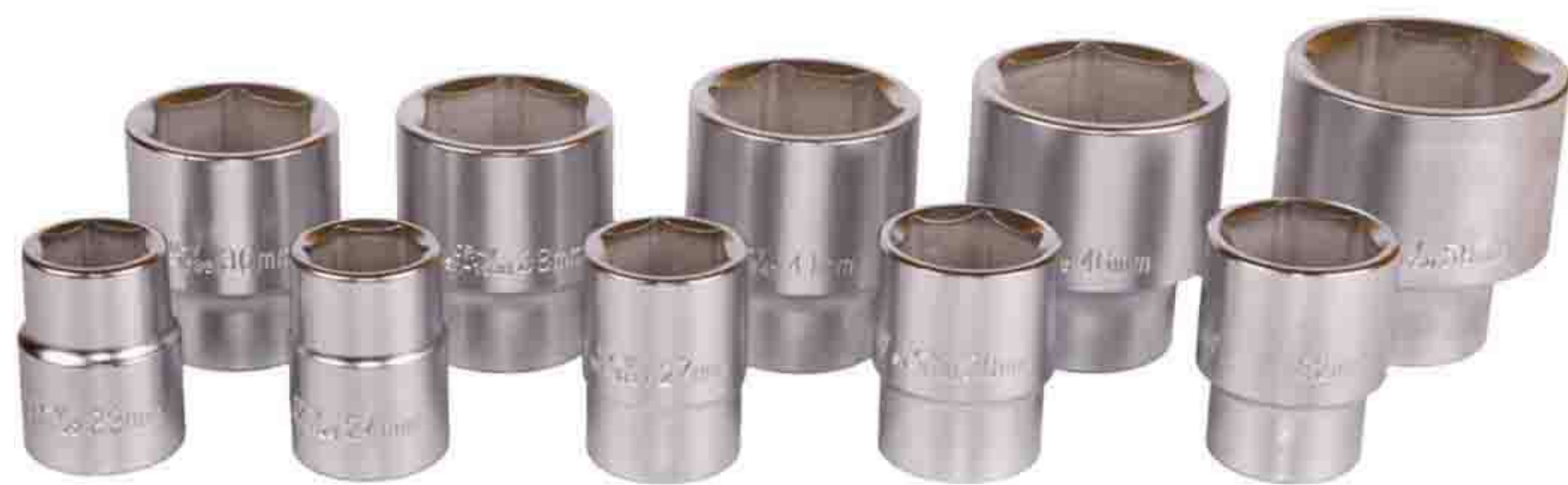
3/4" 系列铬钒钢美式六角短套筒 3/4" Dr. Socket Series 6PT (CR-V)