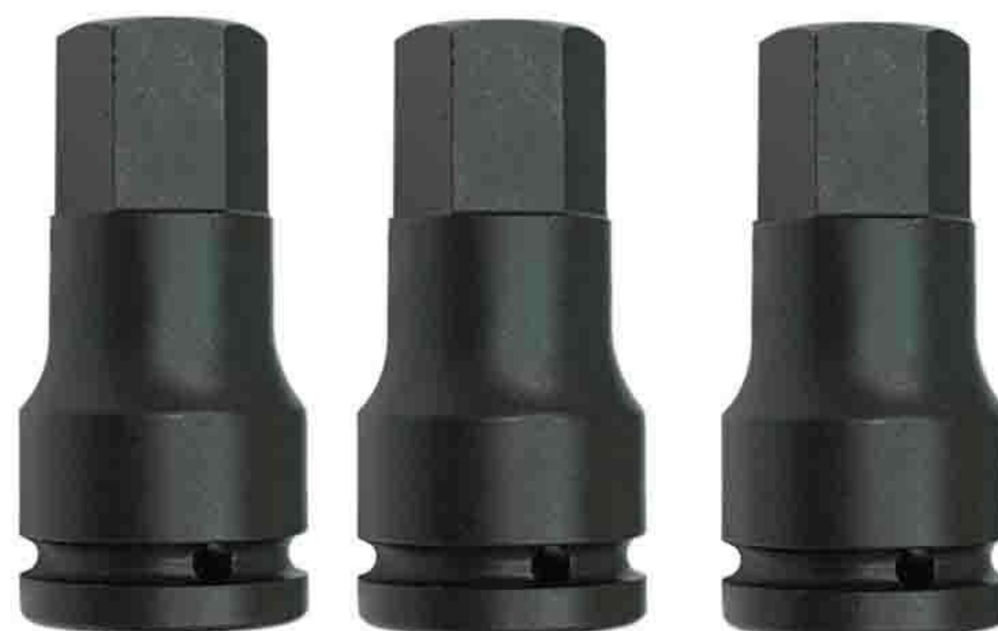
1" 系列铬钼钢一体外六方旋具套筒 1" Dr. impact hex socket series (CR-MO)