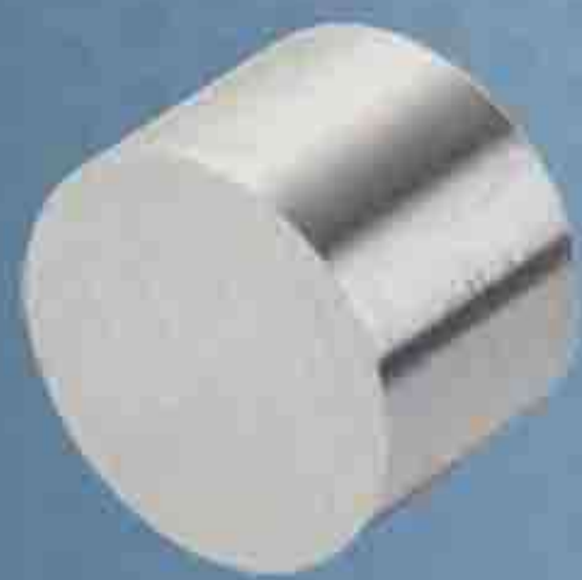
Blank outside ground to size