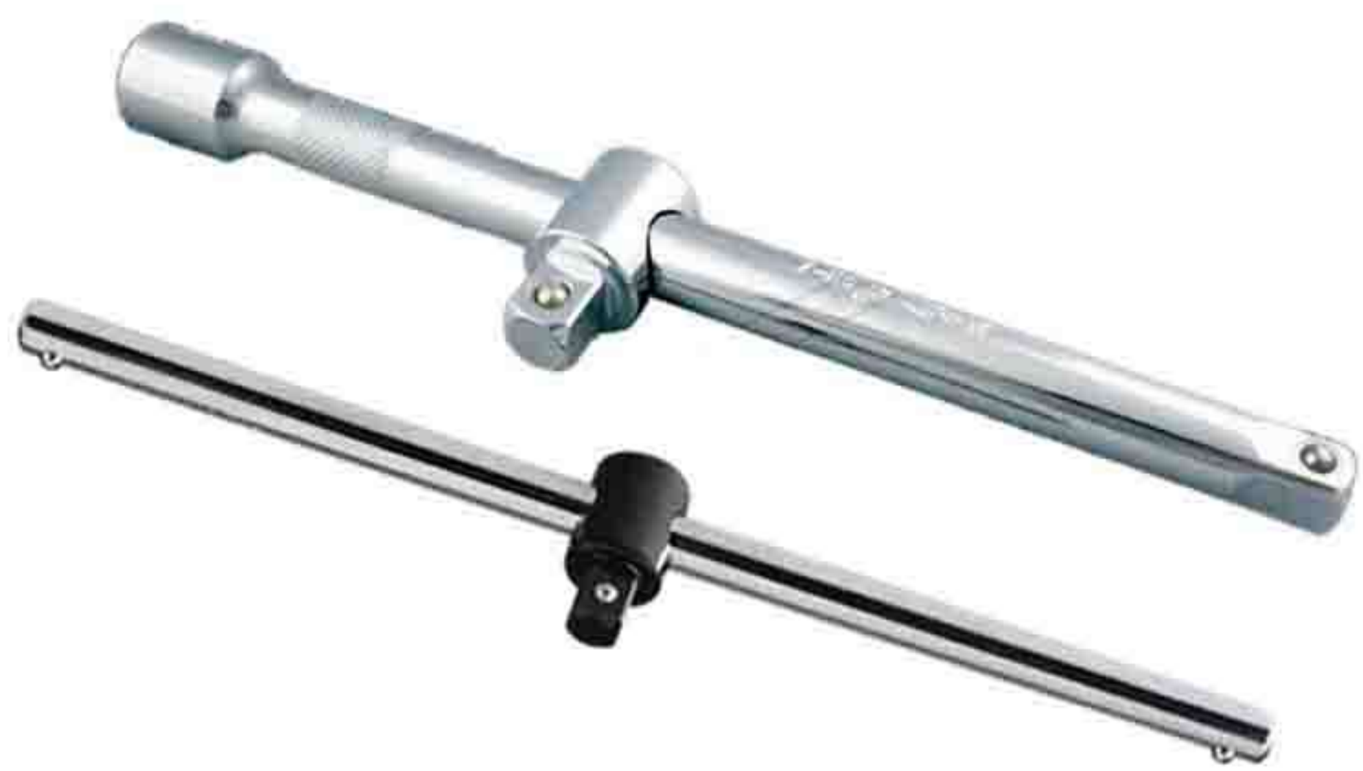
1/2(12.7mm)系列铬钒钢T型滑杆 1/2" Dr. Sliding T-bar series(Cr-v)