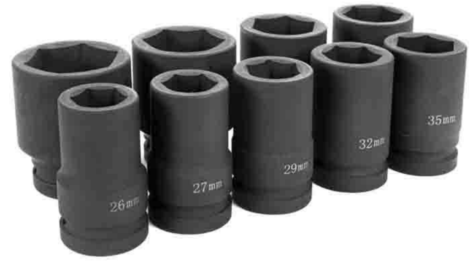
1" 系列铬钒钢欧式气动套筒 1" Dr. Impact Socket Series(CR-V)