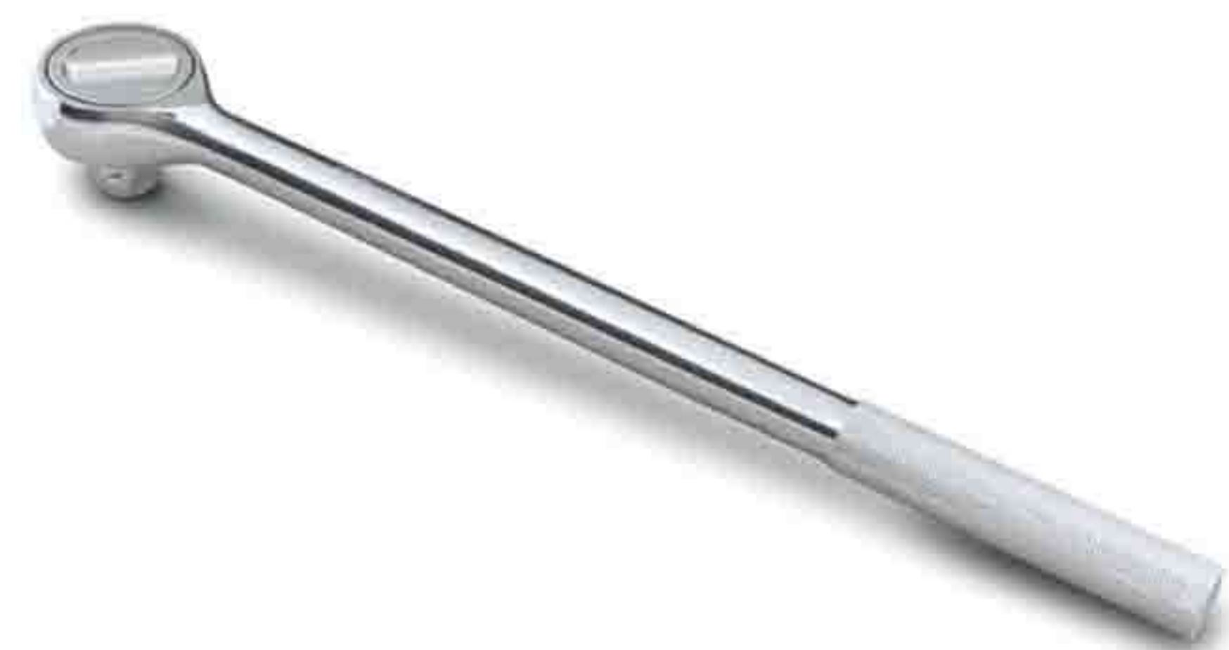
3/4(19mm)系列铬钒钢重型棘轮扳手 3/4" Dr. Ratchet wrench series(Cr-v)