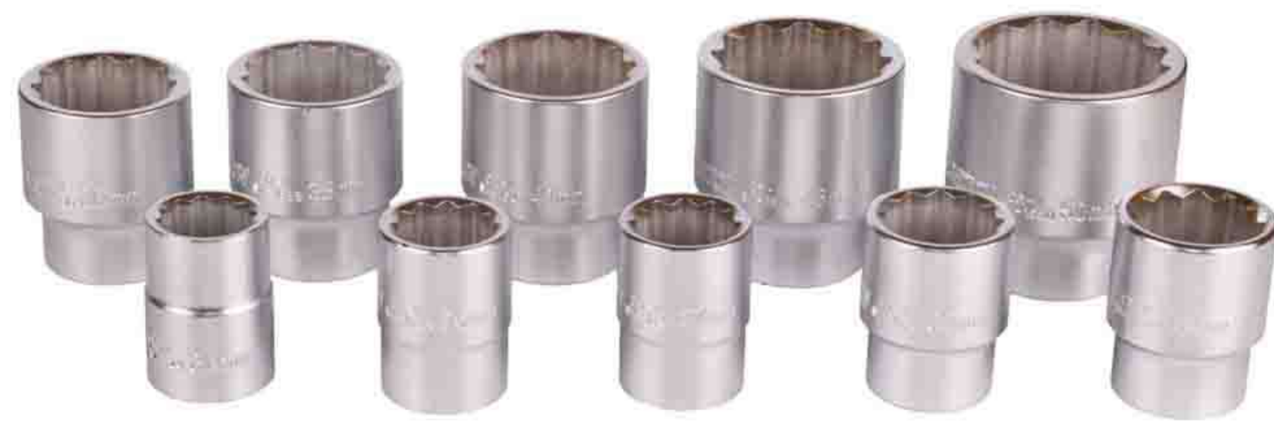
3/4" 系列铬钒钢美式梅花短套筒 3/4" Dr. Socket Series 12PT (CR-V)