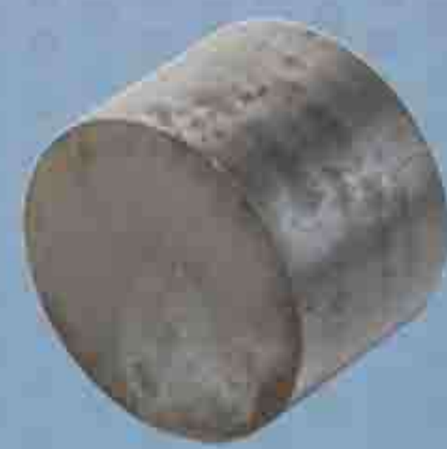
Blank metallurgically heat-treated