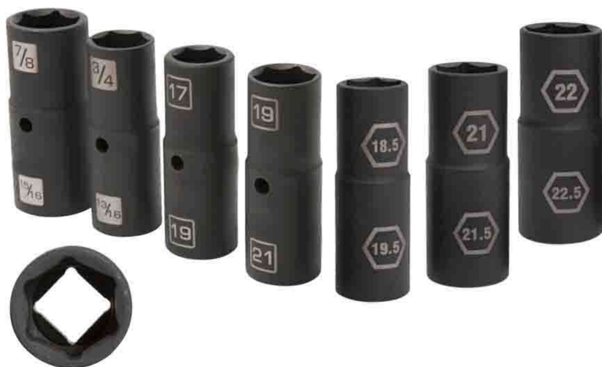
1/2" 铬钼钢薄壁双向气动套筒 1/2" Dr. Thin Wall Flip Impact Socket Series (CR-MO) IMPACT HEX & TORX & Splines Ribes BIT SOCKET