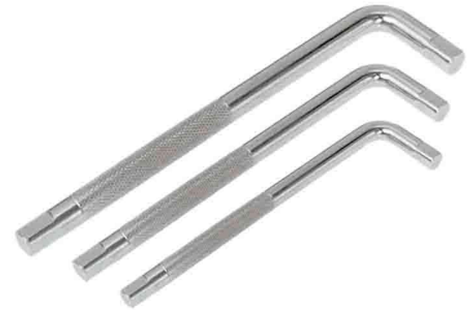
1/2(12.7mm)系列铬钒钢L型弯杆 1/2" Dr. L-shape handle series(Cr-v)