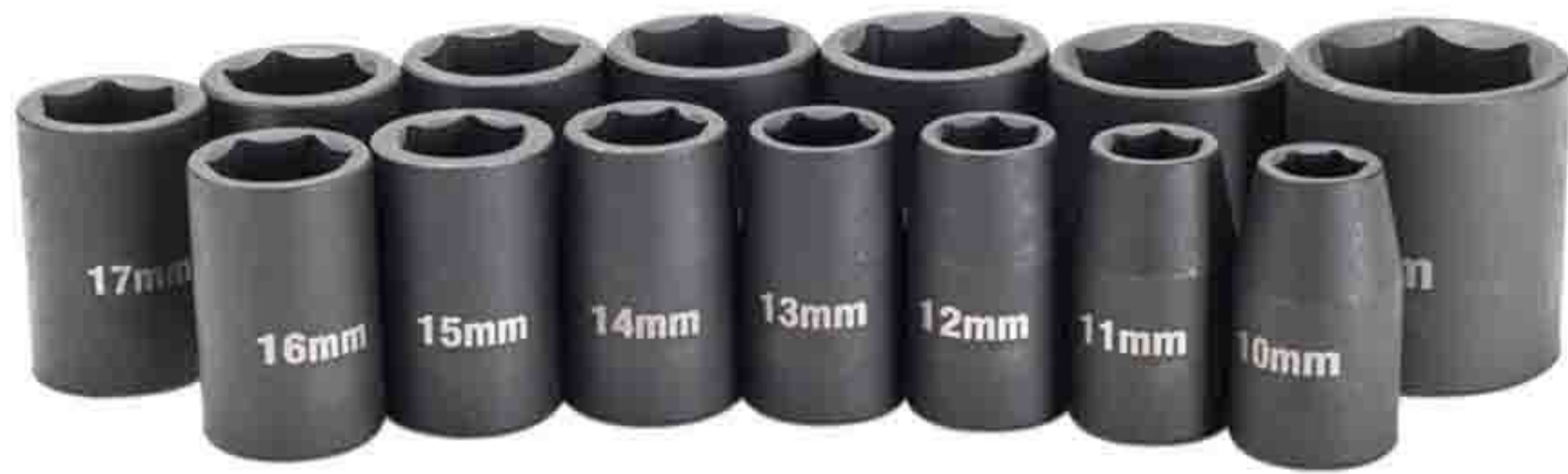
1/2(12.7mm)系列铬钼钢欧式气动短套筒 1/2" Dr. impact socket series(Cr-Mo)