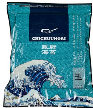
【Chichuu C-Grade Sushi Nori】