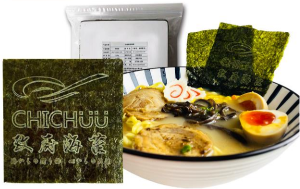
【Chichuu Print Nori】 50sheets*4/bg*84bgs/ctn