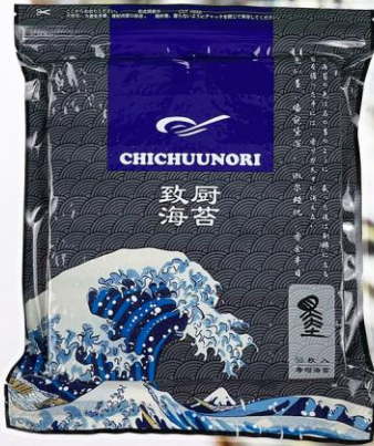
【Chichuu A-Grade Sushi Nori】