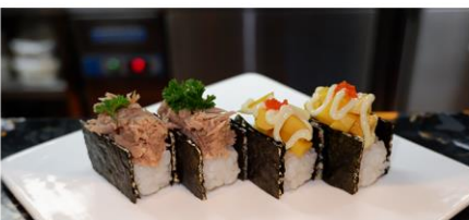
Sandwich Seaweed Gunkan Sushi