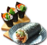
Hand roll Rice and vegetable roll