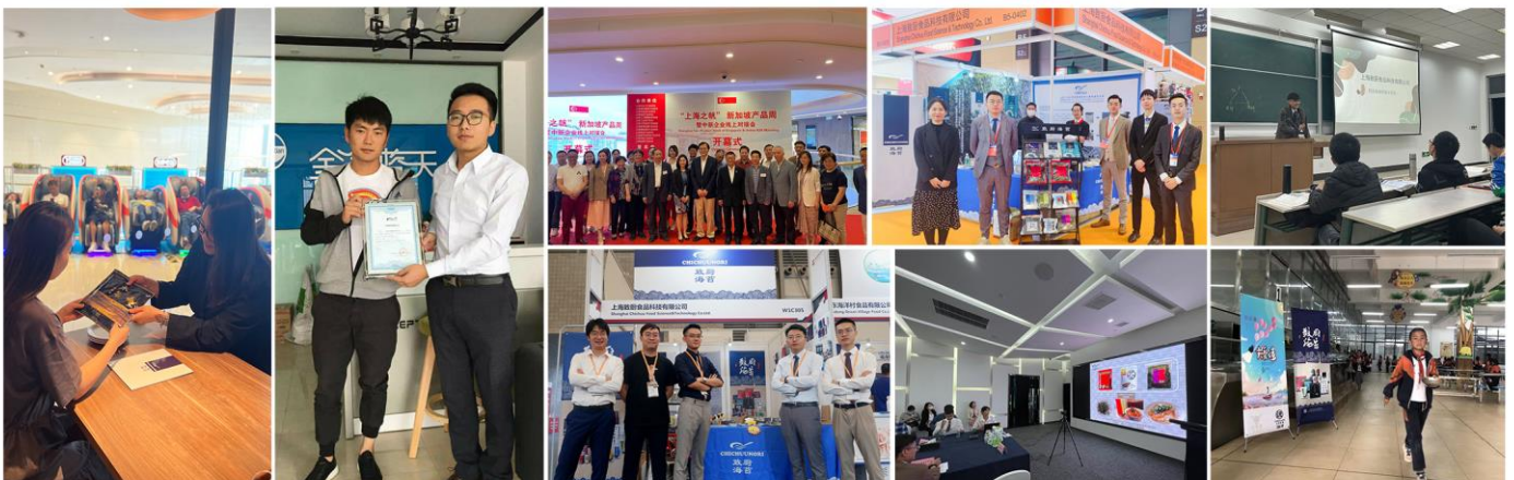
{ Product promotion and customer service }