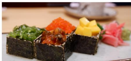
Sandwich Seaweed Small Square Sushi