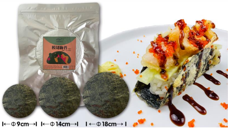
←Φ9cm→ | ←Φ14cm→ | ←Φ18cm→ | ★9cm: 50sheets/bg*240bgs/ctn ★14cm, 18cm: 50shttes/bg*100bgs/ctn