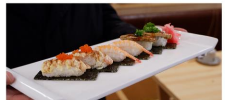
Sandwich Seaweed Nigiri Sushi

Chichuu Sandwich Seaweed Can be integrated with traditional Japanese menu Create diverse dishes and make rich flavors