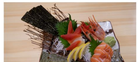
Sandwich Seaweed With Sashimi