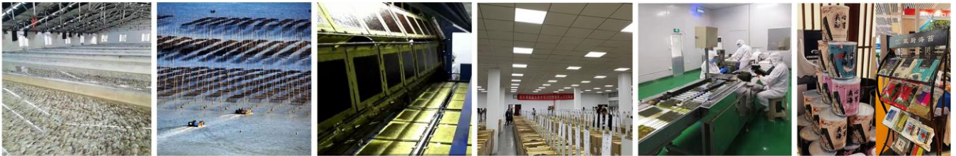
Porphyra seedling cultivation Breeding and picking Primary processing Bidding transaction Secondary processing Market sales

To provide the most appropriate products to the customers who need them most, we are practicing. To pay close attention to the customer experience, we are constantly improving and innovating. Chichuu Food has been exported overseas. We are looking forward to seeing the world. Let every taster enjoy the happiness is our eternal principle.