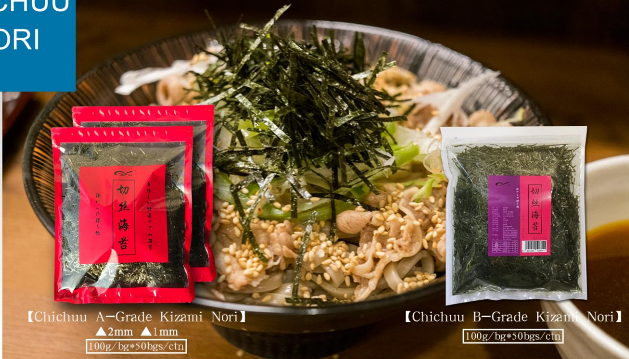
【Chichuu A-Grade Kizami Nori】 ▲2mm ▲1mm 100g/bg*50bgs/ctn