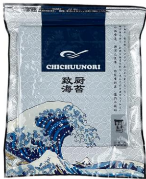
【Chichuu B-Grade Sushi Nori】

The raw material is fresh and strictly selected from the first picked porphyra yezoensis in the 34° N sea area of Lianyungang. It adopts a non-additive baking process and has a fragrant and tender taste. It is a high-end sushi nori that can be eaten immediately. Suitable for high-end Japanese food stores.